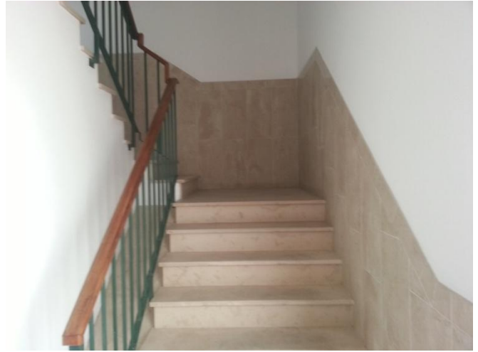
Two floors up