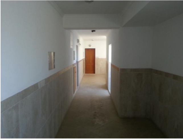
Across the hallway